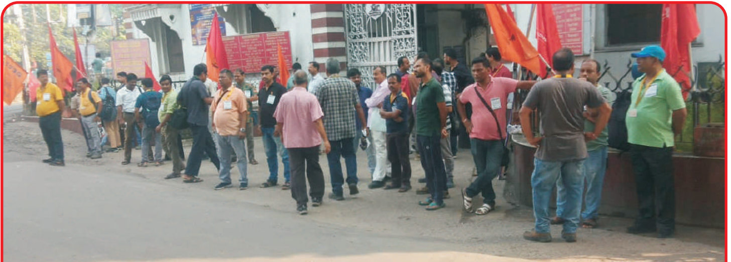
OF DUM DUM