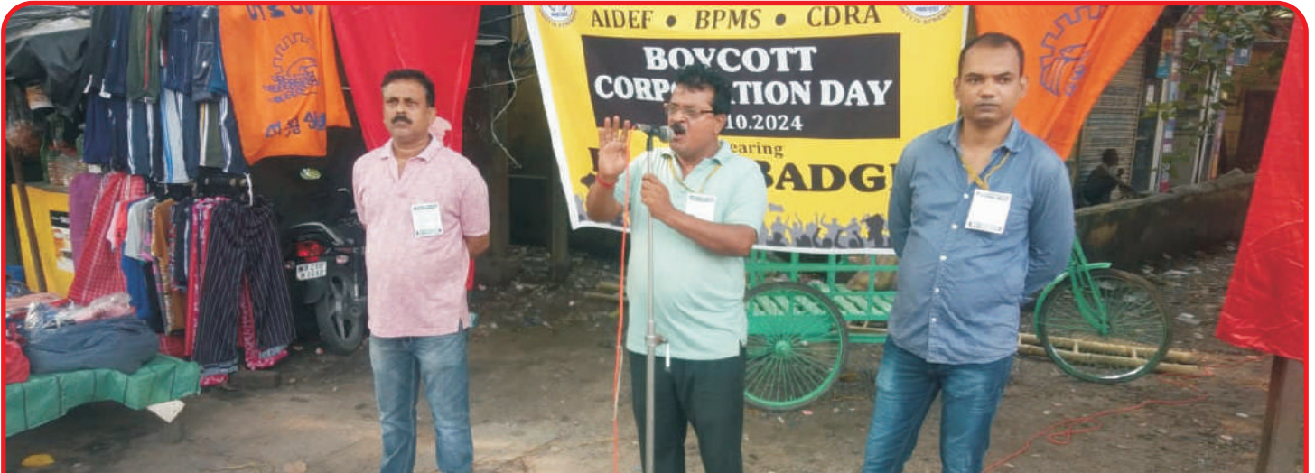
OF DUM DUM